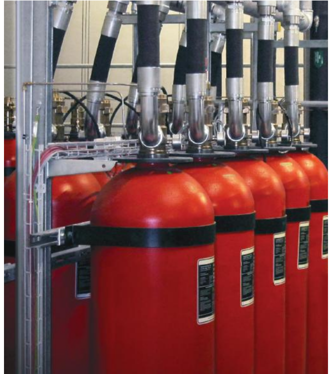
Minimax can provide multi-cylinder systems to protect any special hazard area