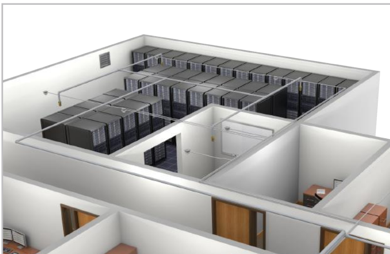
725 psi systems make it possible to locate agent supply away from the protected area.